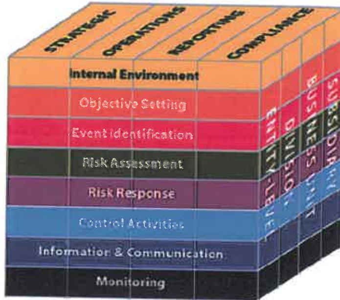
Figure 1: Enterprise Wide Risk Management Process (COSO)

To Fulfil its philosophy and implement an enterprise-wide integrated approach, Ngqushwa Municipality will ensure that the eight (8) components of the ERM process are implemented and operating effectively and economically ( Refer to figure 1 )